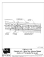
Figure V-5.3.6 Example of a Check Dam Along a Sloped Section of Permeable Pavement