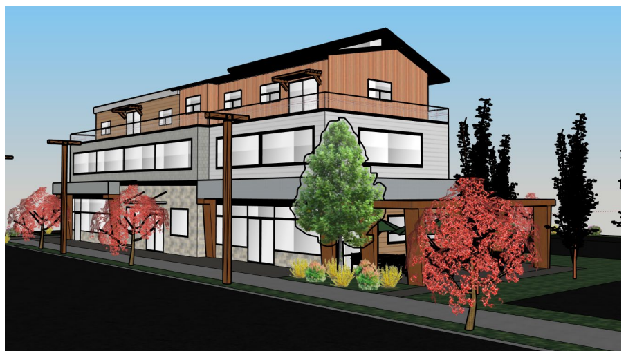
Right - Proposed Mixed-Use Building looking southeast from Mill Spur