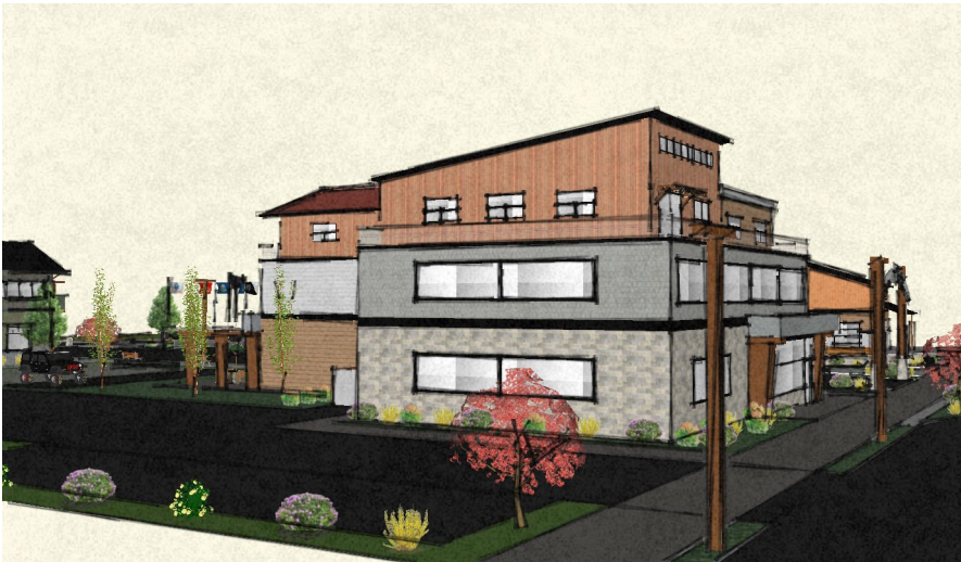
Left - Proposed Mixed-Use Building from Main Street looking northwest