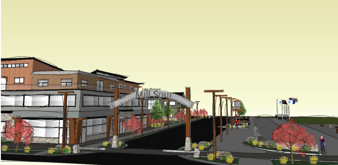
Above - Mill Spur looking west from Main Street